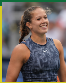
Ariana Arsénault PRO ATHLETE