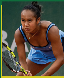
Leylah Annie Fernandez PRO ATHLETE

Together, our athletes, our Funders and Tennis Canada will achieve our world leading potential and create a legacy that advances the sport for the next generation.