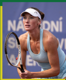
Carson Branstine PRO ATHLETE