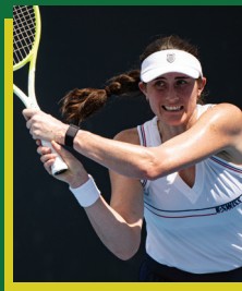
Rebecca Marino PRO ATHLETE