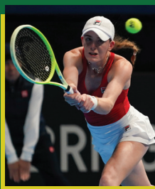
Kayla Cross PRO ATHLETE