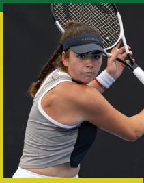
Marina Stakusic PRO ATHLETE