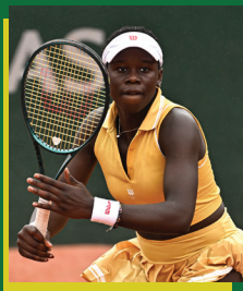
Victoria Mboko PRO ATHLETE