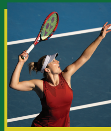
Gabriela Dabrowski PRO ATHLETE