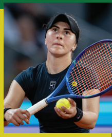
Bianca Andreescu PRO ATHLETE