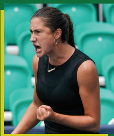
Cadence Brace PRO ATHLETE