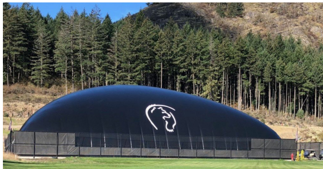
4-court dome – Bear Mountain Tennis (Manufacturer: The Farley Group)