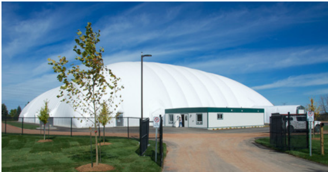
(Manufacturer: The Farley Group)

Can be inflated and deflated in a few short hours