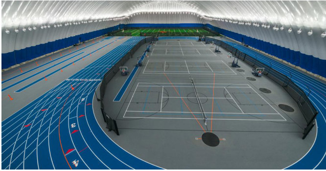
Todd and Jen Hutton Sports and Recreation Center (Manufacturer: Yeadon)

Can house multiple sports all under one dome