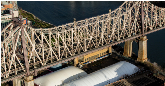
4-court and 7-court domes – Roosevelt Island Tennis (Manufacturer: The Farley Group)

Can be built to any size and the outer fabric comes in several colours