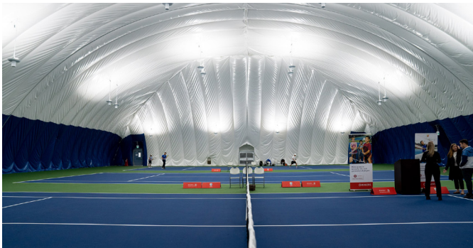
Premier Racquet Club Markham (Manufacturer: The Farley Group)

Most cost-effective building system available when it comes to covering large, clear span space.