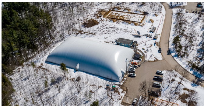
4-court seasonal dome – Barrie North Winter Tennis (Manufacturer: The Farley Group)

Insulated fabrics and powerful heating and air-conditioning units provide ideal playing conditions year-round