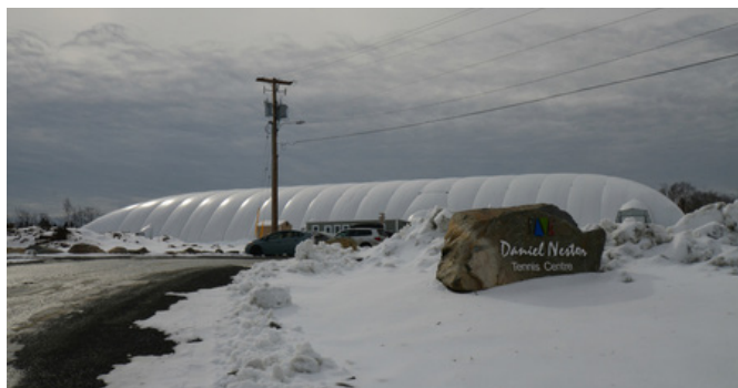
6-court permanent dome – Atlantic Training Centre (Manufacturer: The Farley Group)