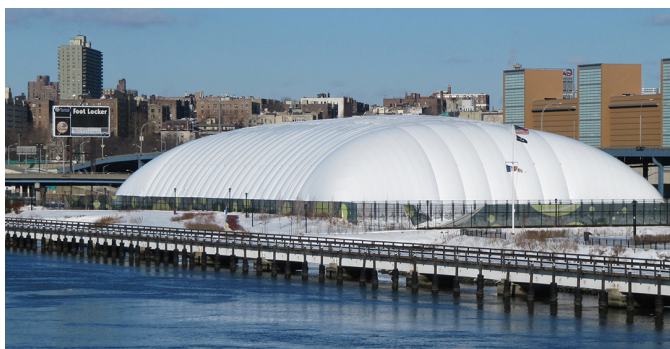
12-court dome – Stadium Tennis Center at Mill Pond, LLC (Manufacturer: The Farley Group)

Can be erected over virtually any existing tennis facility, regardless of the location or orientation of the tennis courts