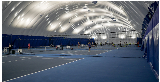
6-court dome at Marilyn Redvers Tennis Centre (Manufacturer: The Farley Group)