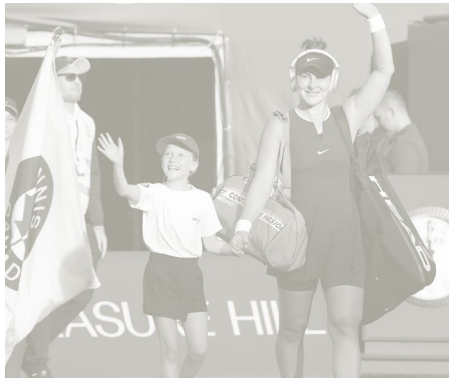
NATIONAL BANK LITTLE ACES PLAYER IDENTIFICATION