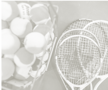
WPDP TRAINING ENVIRONMENT